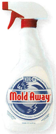
MOLD AWAY Mildew and Mold Remover