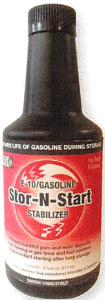
STOR-N-START Gas and Diesel Storage Stabilizers