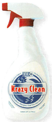
KRAZY CLEAN All Purpose Cleaner