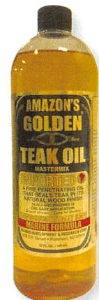
AMAZON'S GOLDEN TEAK OIL Used by the Pro's to Restore Teak

When expecting products that really work, try MDR/Amazon's